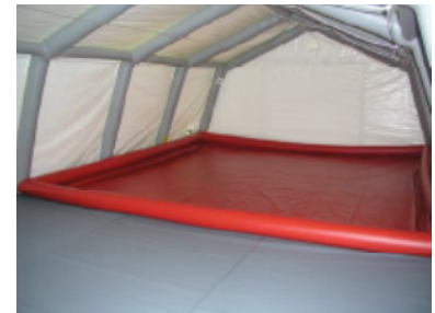
Single decon pool in a tent, discharge by pumping