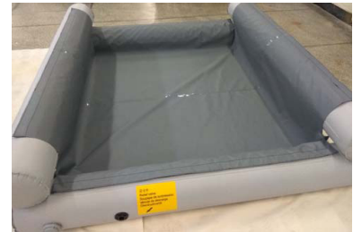
Decon pool with gravity discharge port at sides